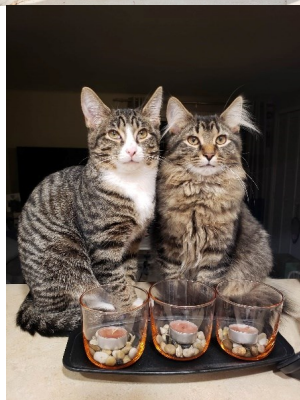
Oliver & Theodore "Yea congrats .. Where's our food"